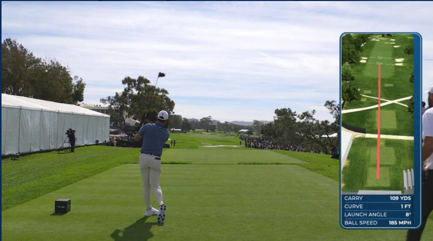
Example – Click here