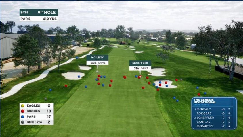
Example – Click here