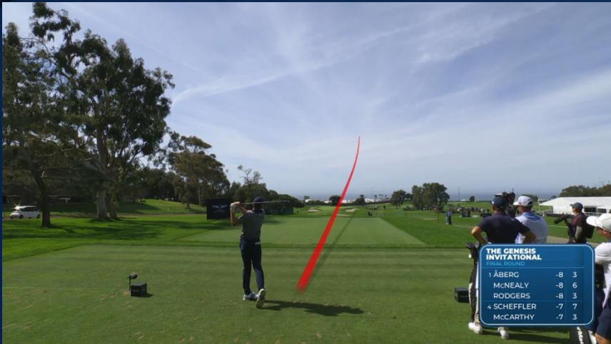
Example – Click here