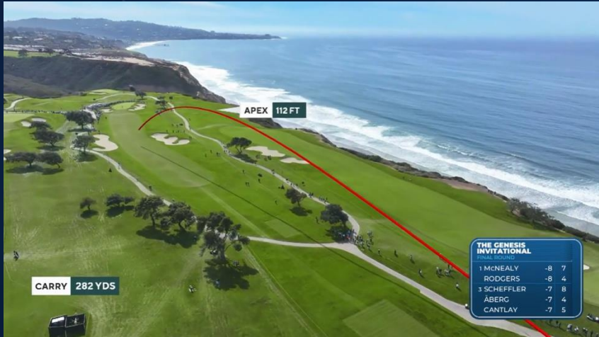
Example – Click here