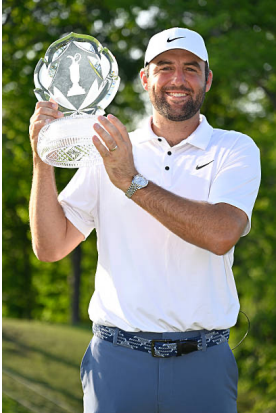
Scottie Scheffler the Memorial Tournament presented by Workday

Scottie Scheffler earned his 16 th PGA TOUR win in his 142 nd career start. He is one of three players to earn 3 or more PGA TOUR wins in the 2025 season (3, Rory McIlroy & 3, Ben Griffin).